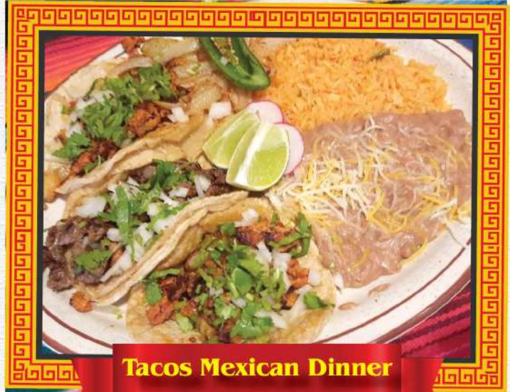
Tacos Mexican Dinner

Barbacoa/brace beef Pollo Asado/ Grilled Chicken Tinga/ Pulled Chicken Tripa/Tripe Add 50¢ Lengua / Tongue Add 50¢ Pescado / Fish Add 50¢ Camarón / Shrimp Add 50¢