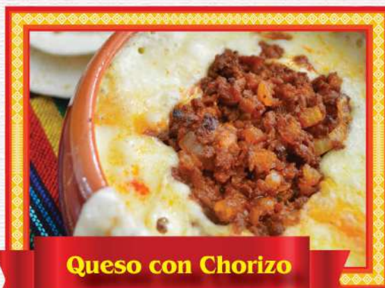
Queso con Chorizo

"Food Prepared Fresh Daily with Highest Quality Ingredients"