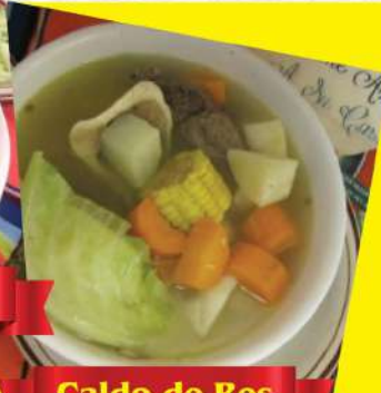
Caldo de Res